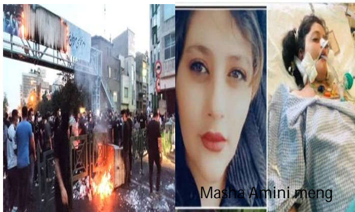
Masha Amini meng

Security dungniu Iran ga protesters chamai 76 kamsat tang mide.